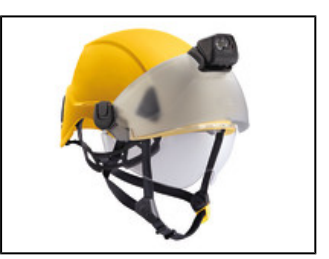
With its potential for integration of a Petzl headlamp, hearing protection, and multiple accessories, it is an entirely modular helmet, thus responding to the specific additional needs of professionals.