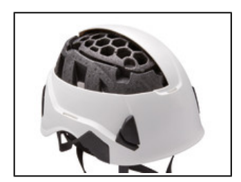
The liner is designed in two parts, EPP (expanded polypropylene) and EPS (expanded polystyrene) for reduced weight.

The STRATO helmet is very lightweight and comfortable, thanks to its CENTERFIT and FLIP&FIT systems, which guarantee that the helmet fits securely on the head. The adjustable-strength chinstrap makes it ideal for both work at height and on the ground. The unventilated outer shell protects against electrical hazards, molten metal splash and flames. With its potential for integration of a Petzl headlamp, hearing protection, and multiple accessories, it is an entirely modular helmet, thus responding to the specific additional needs of professionals.