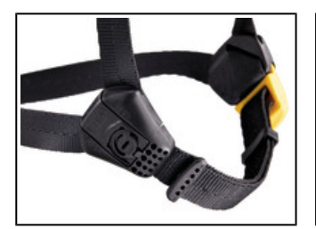
The clip of the DUAL chinstrap allows the worker to adjust chinstrap strength in order to adapt the helmet to different environments: work at height (EN 12492) or on the ground (EN 397).